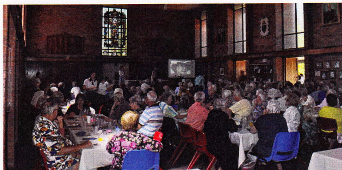
A large number of seniors attended the Senior's week lunch in Halse Hall at All Souls St Gabriels School on Sunday.